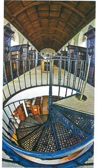
Upper Old Library.

The Old Library consists of an Upper and a Lower Library. The Library houses the College's rare books and manuscripts. It contains all books dating from before 1800, and other special collections. Any member of the College and any visitor can consult our special collections in the Rare Books Reading Room during staffed hours, 9am-1pm and 2pm-5pm, Monday to Friday. More information on the Old Library can be found at http://www.joh.cam.ac.uk/old-library